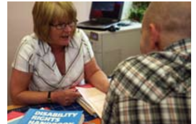
Food banks can signpost people to other forms of help or provide advice – but they cannot tackle the root causes of food poverty

There is a need for informed debate about the presence of national-scale emergency food initiatives; the need for such interventions should be a cause for serious concern and the potential consequences, particularly the impact upon people suffering from food poverty, need urgent attention.